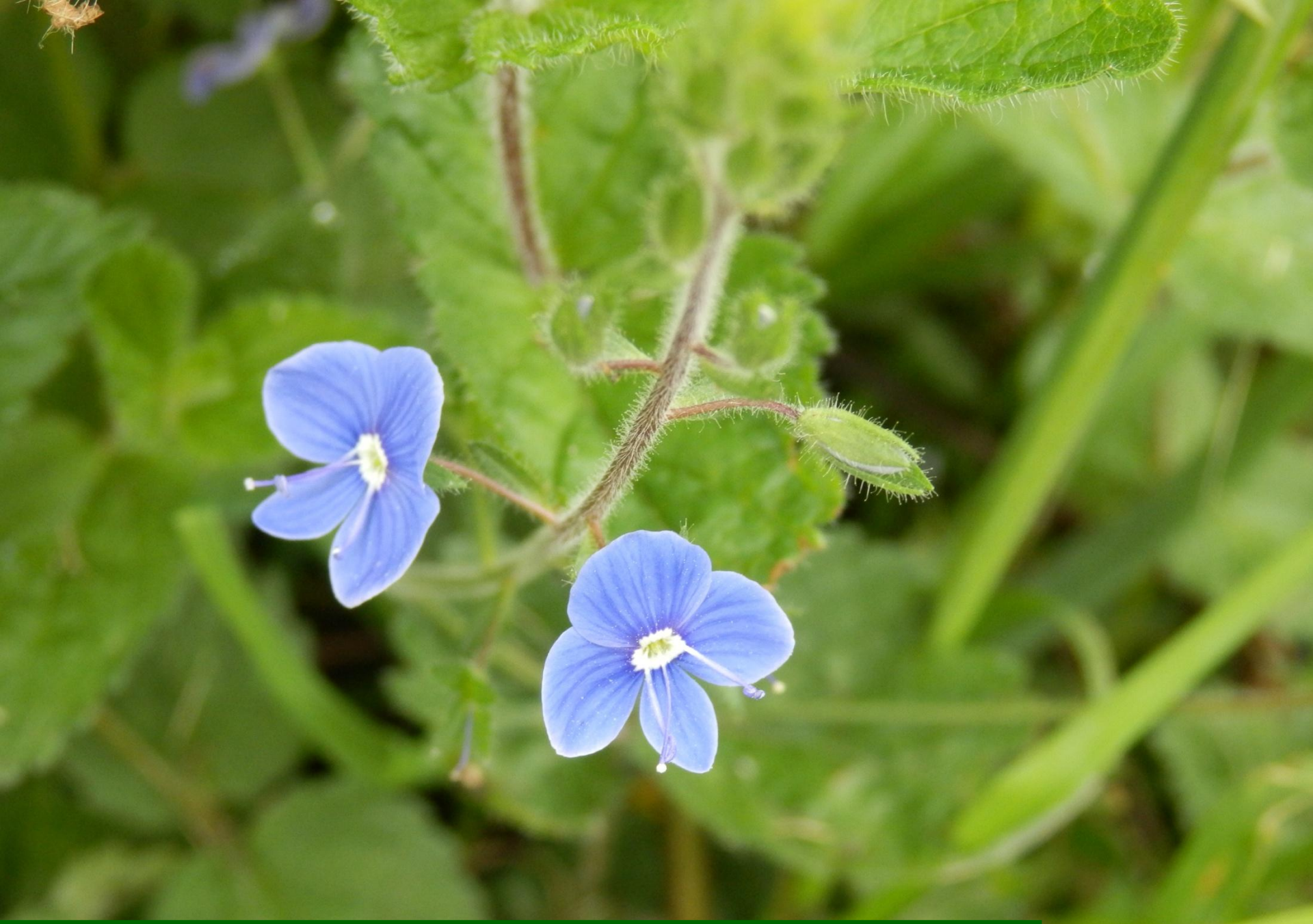
Germander speedwell, reaching out in Watery Lane