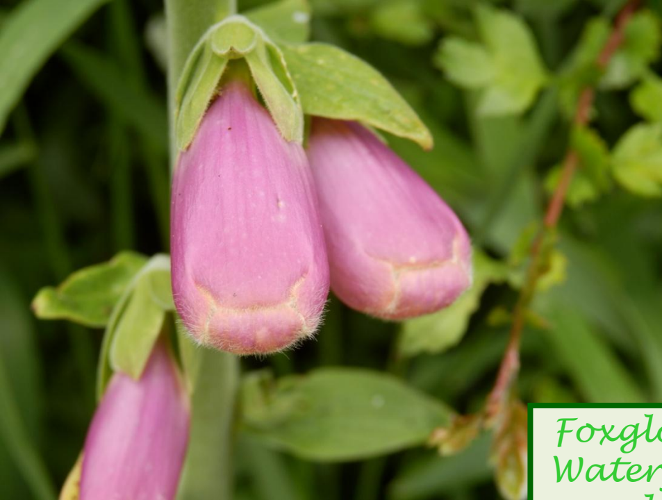
Foxgloves in Watery Lane and Back Lane