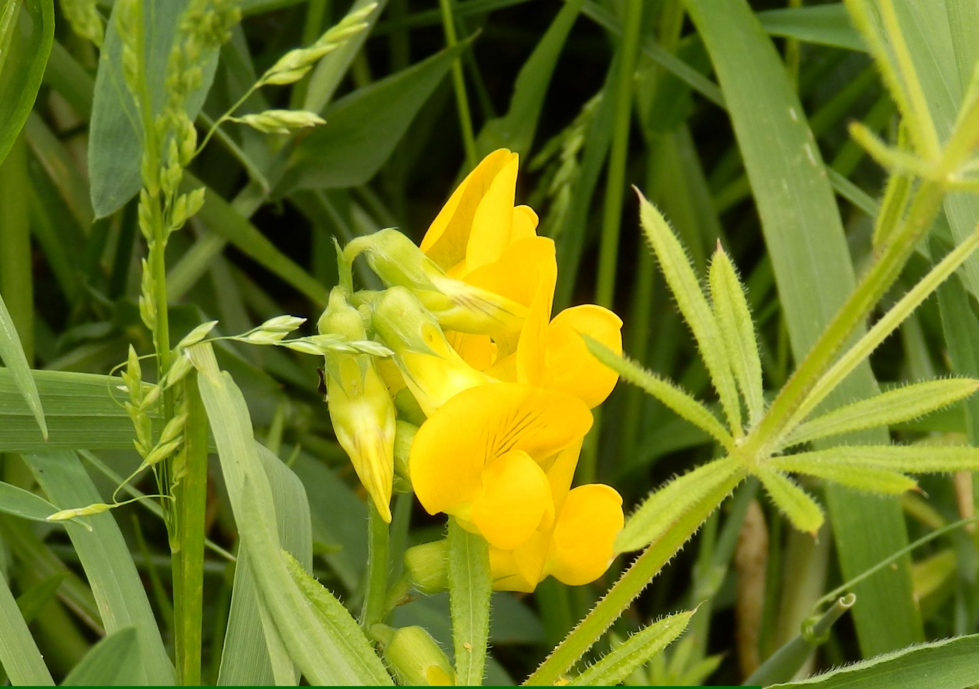
This horseshoe vetch is almost glowing on a dull day.