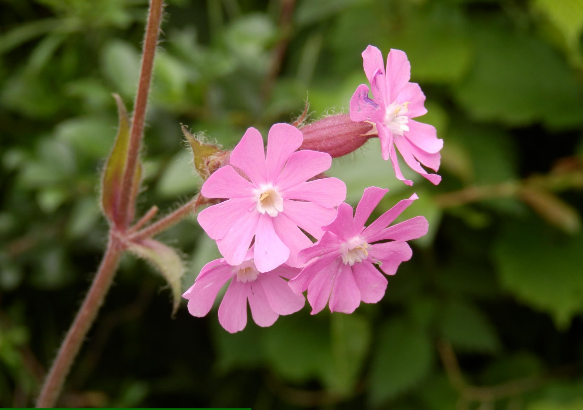
Red campion in Dale Lane