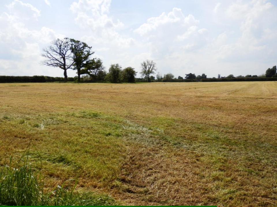
Farmers have been making hay while the sun shone.