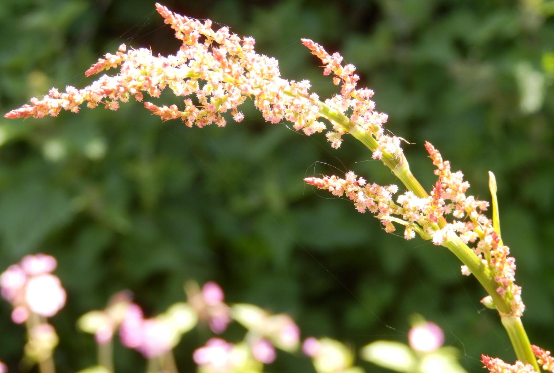
Sheep's sorrel in Watery Lane