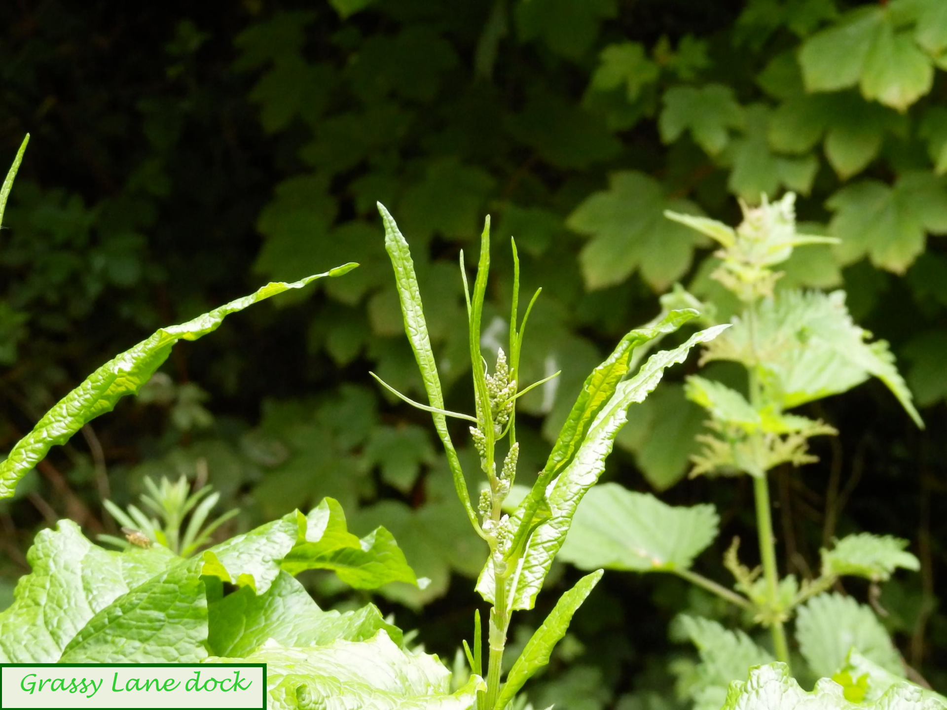
Grassy Lane dock