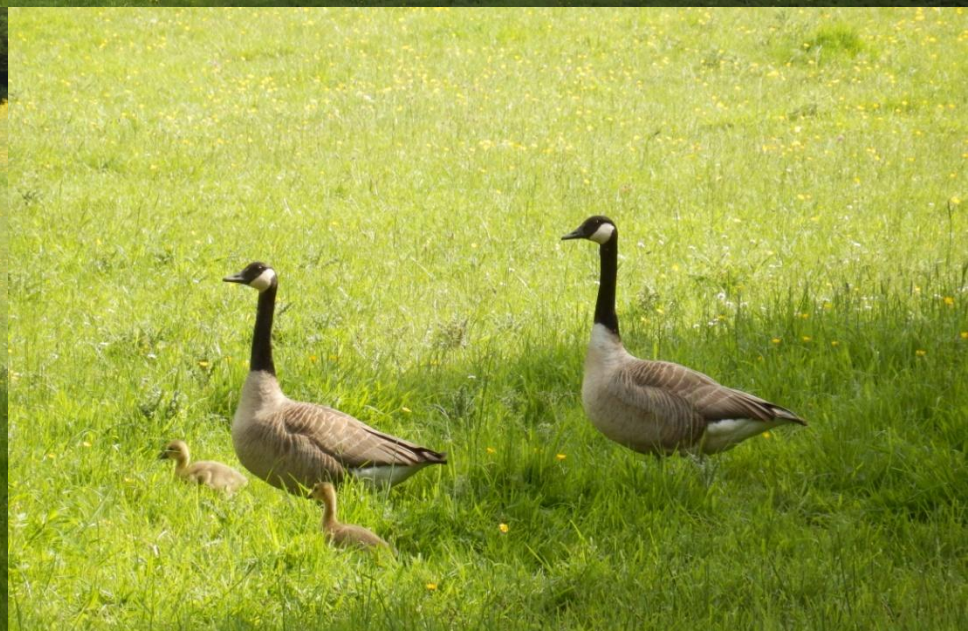
A family of Canada geese at Shut Heath.