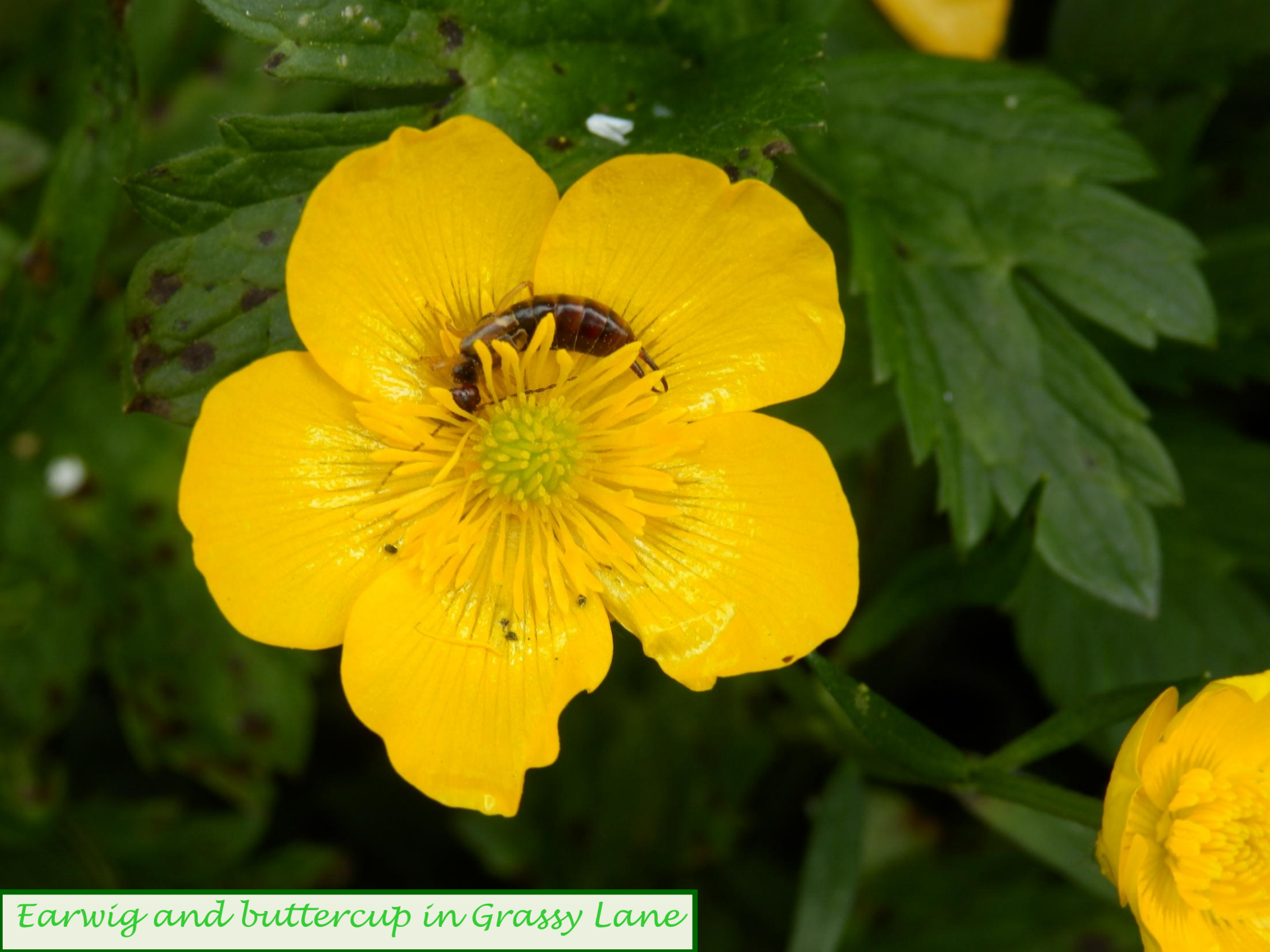
Earwig and buttercup in Grassy Lane