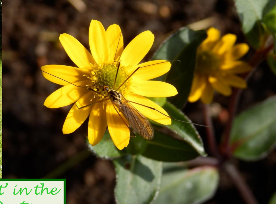
'Sunset' in the new Rectory Lane bed.