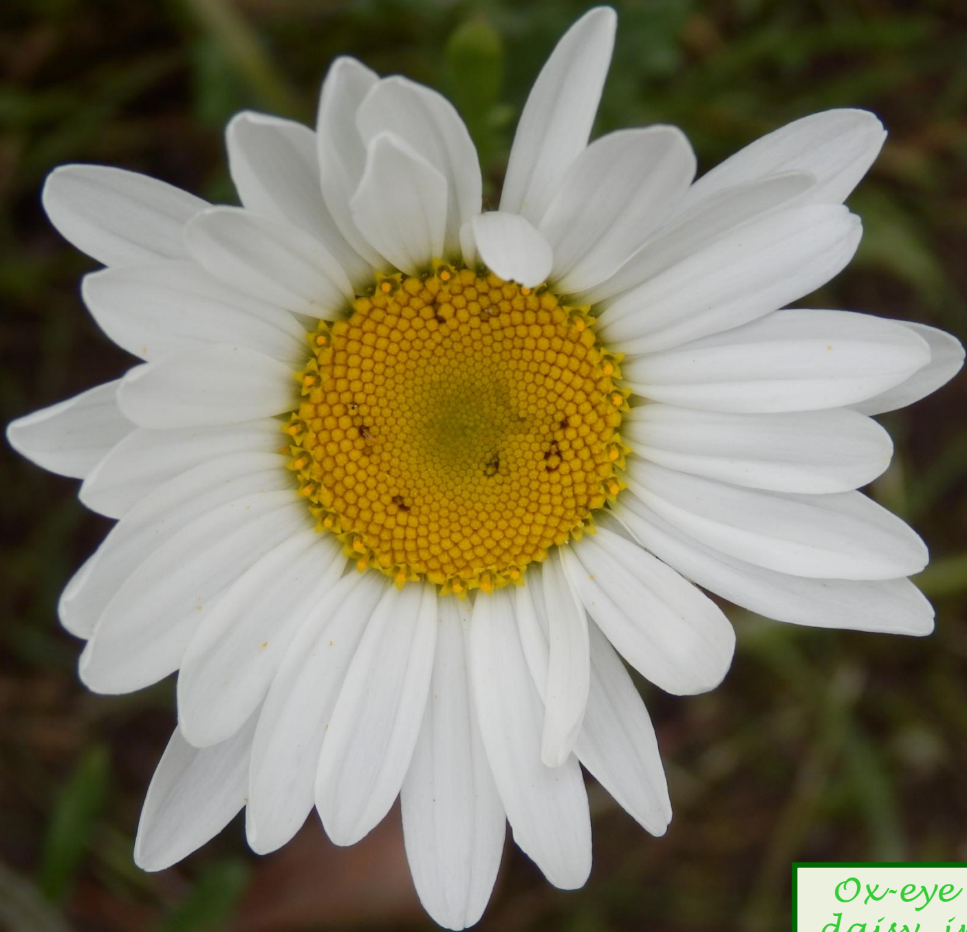
Ox-eye daisy, or dog daisy, in Watery Lane