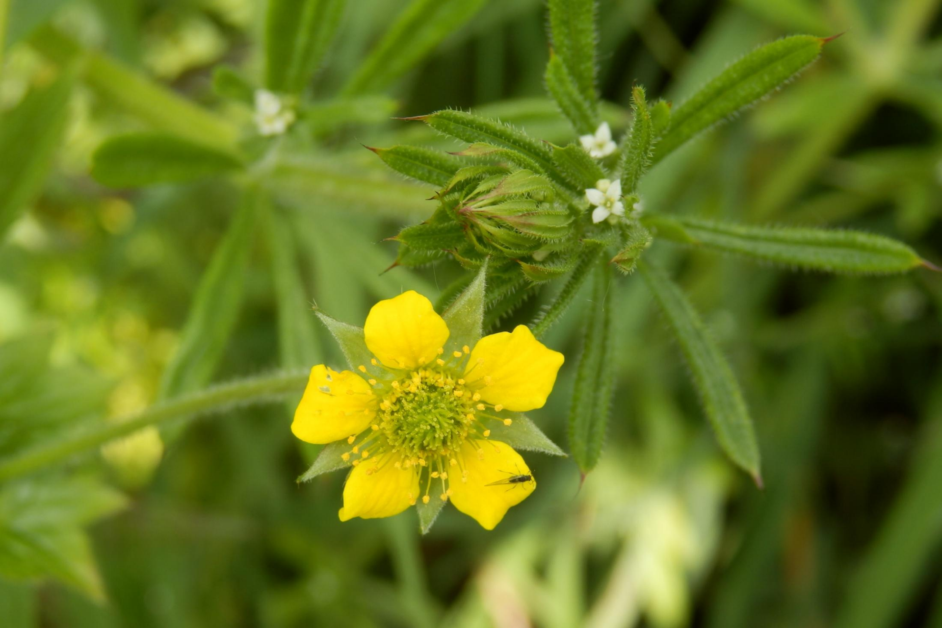
Wood avens, or herb bennet, growing with cleavers in Grassy Lane