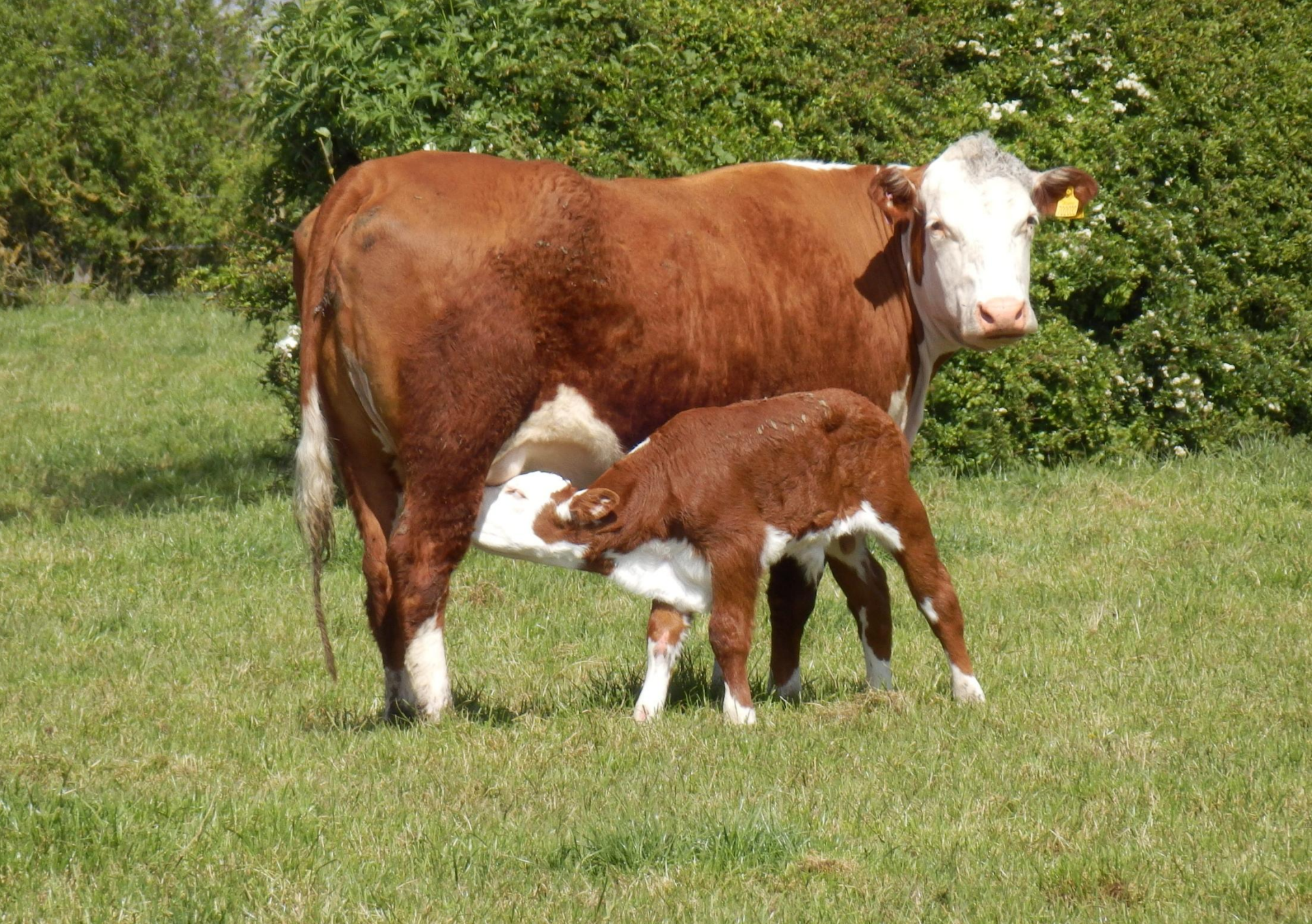
Tranquillity in Dale Lane