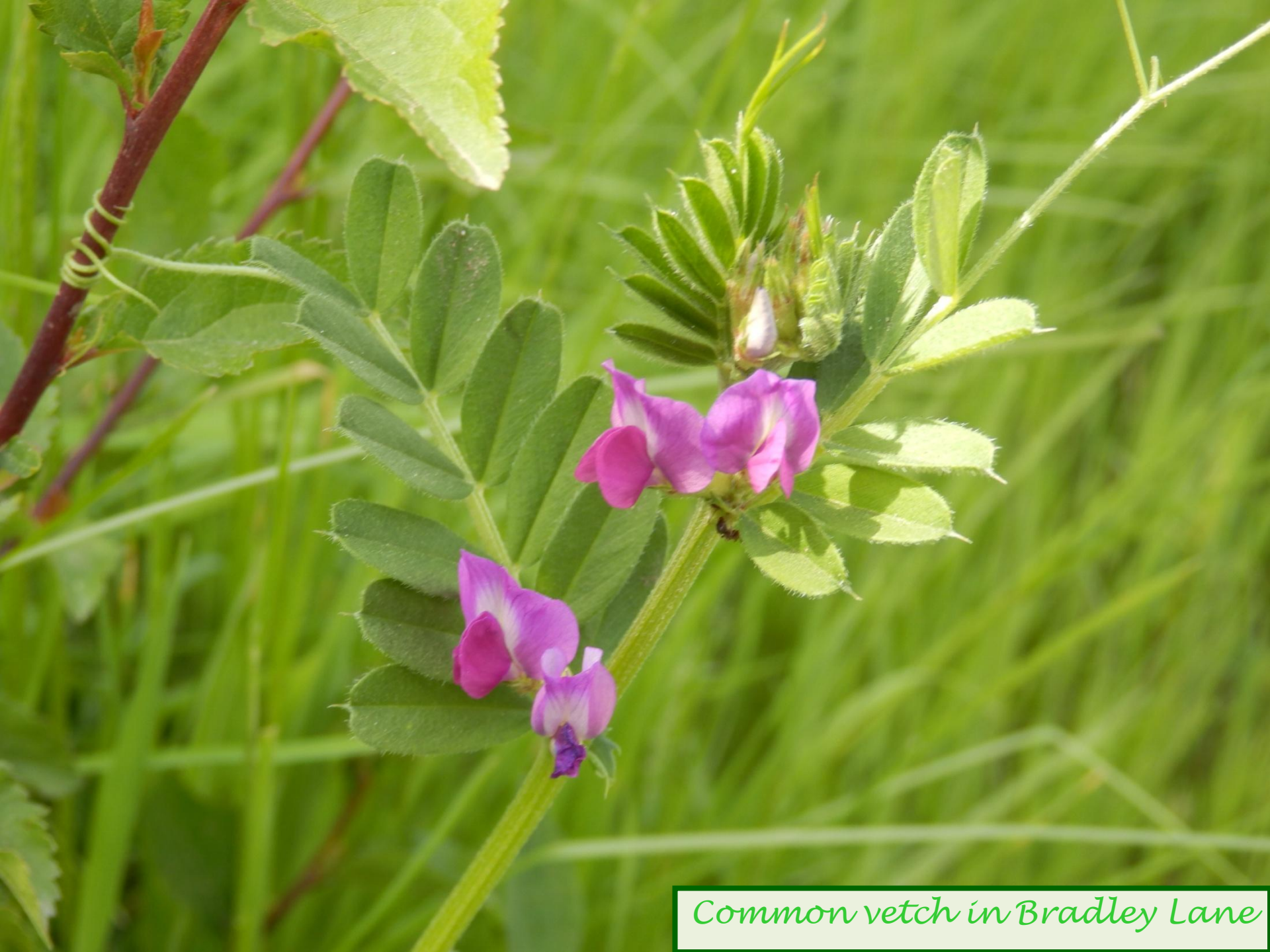
Common vetch in Bradley Lane