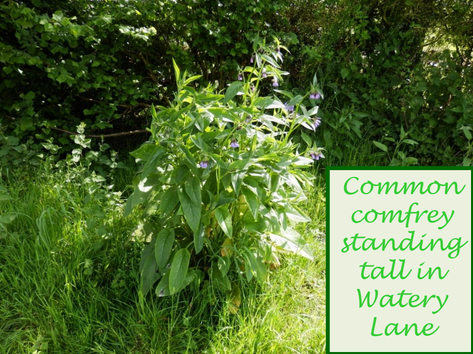
Common comfrey standing tall in Watery Lane