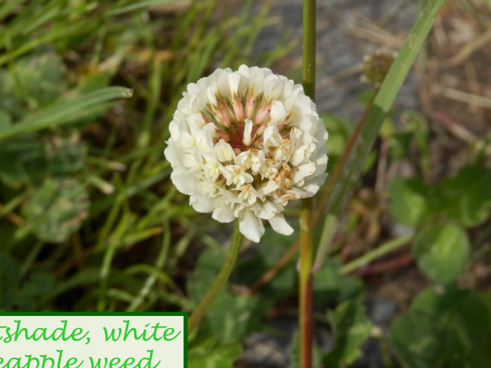
Woody nightshade, white clover, pineapple weed and elder in the lanes