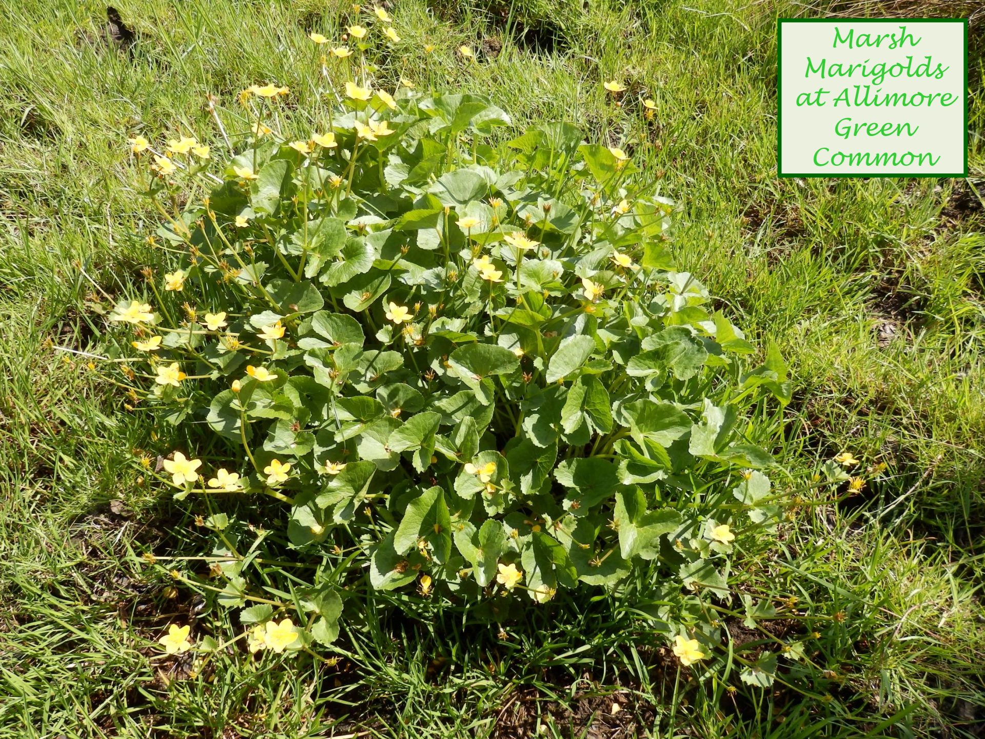
Marsh Marigolds at Allimore Green Common