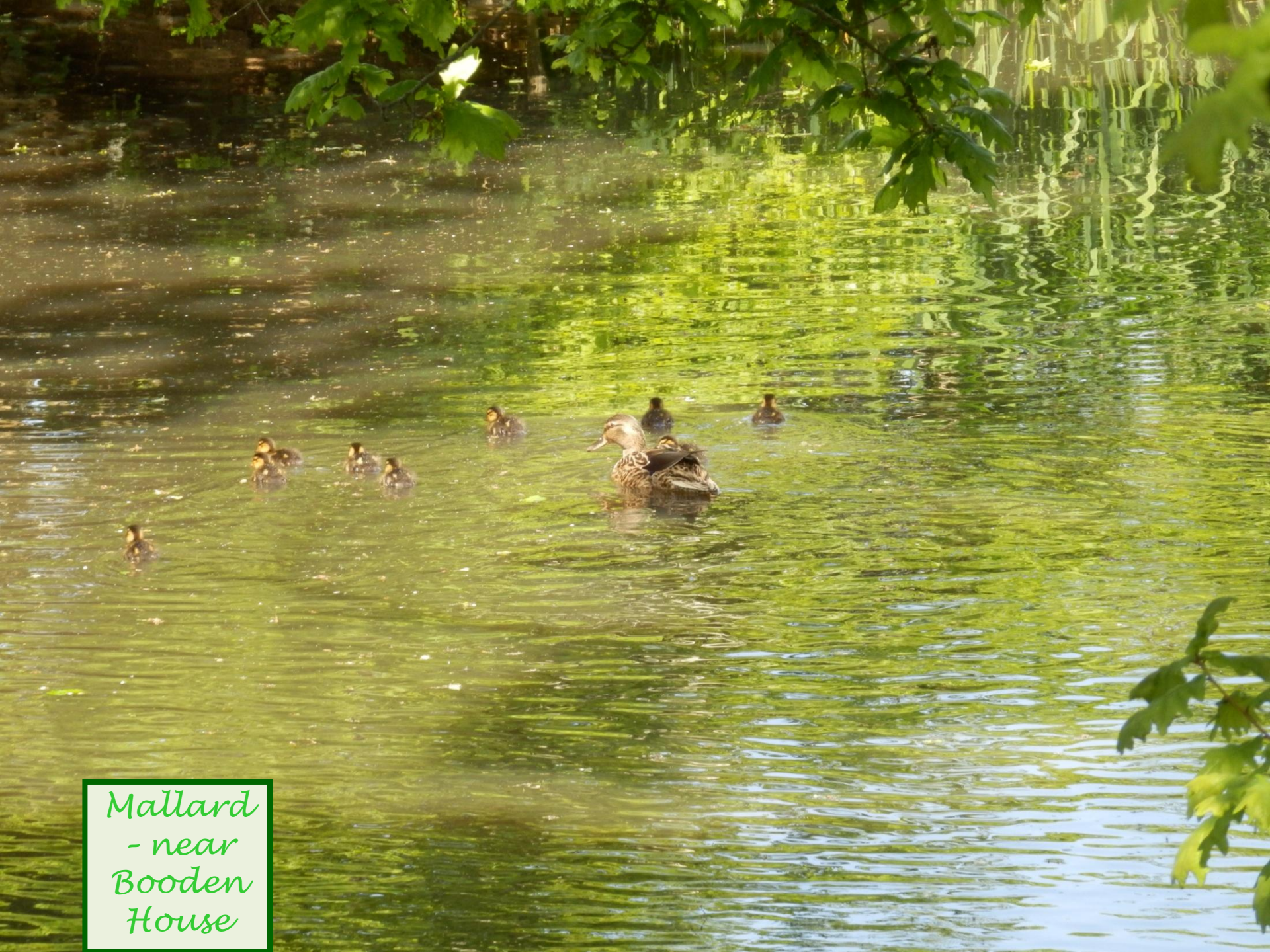
Mallard - near Booden House