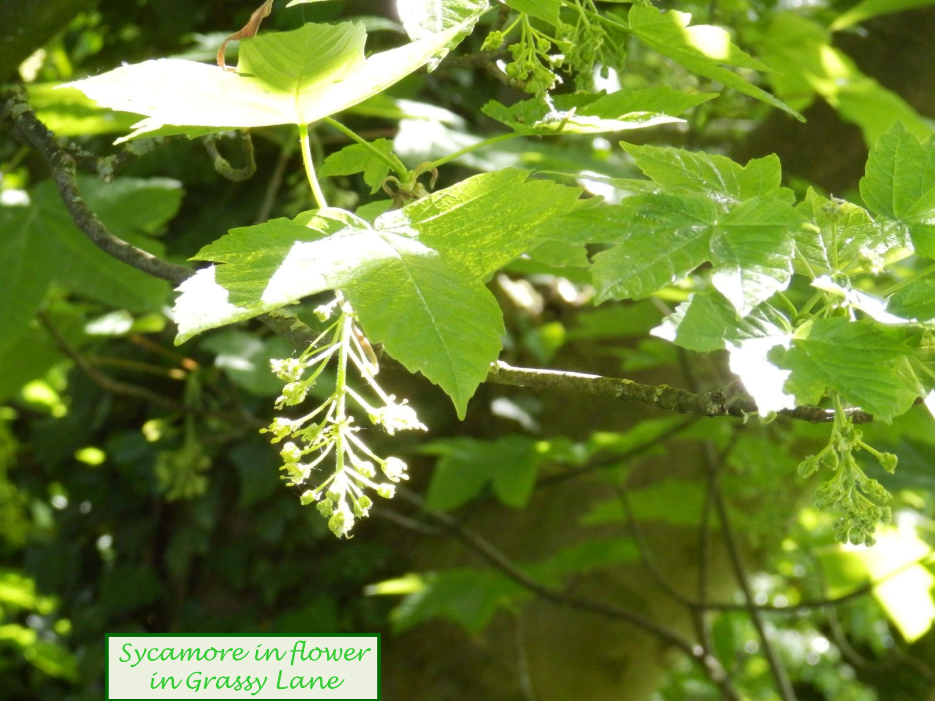
Sycamore in flower in Grassy Lane