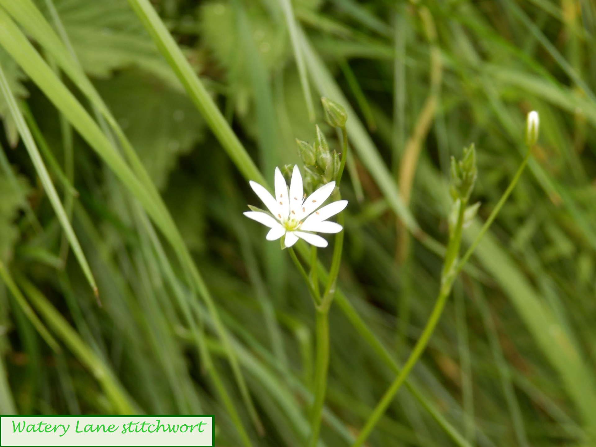
Watery Lane stitchwort