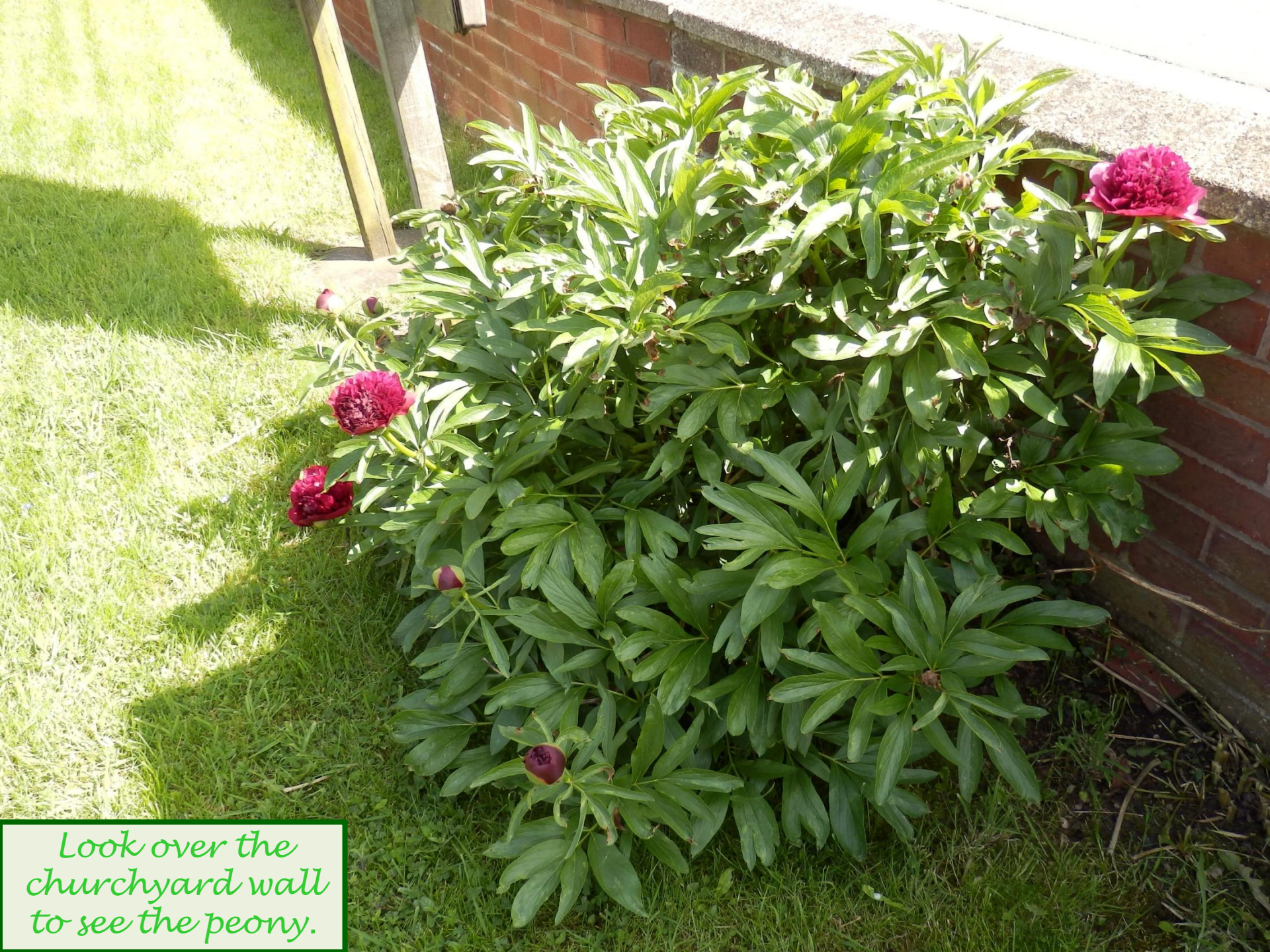
Look over the churchyard wall to see the peony.