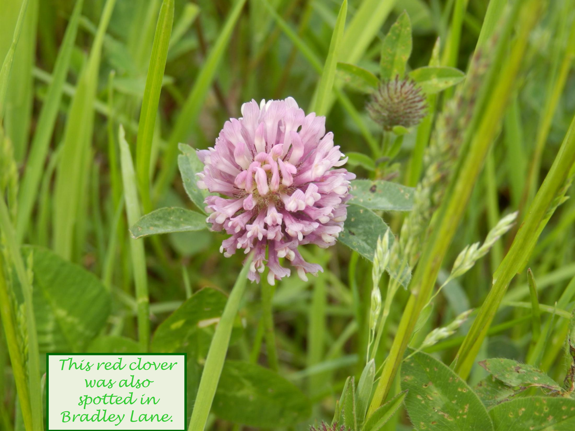
This red clover was also spotted in Bradley Lane.