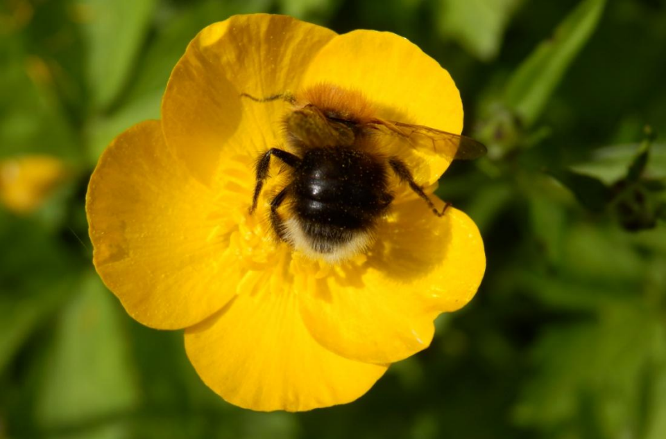
Bzzzzzz ... Grassy Lane bees and bug